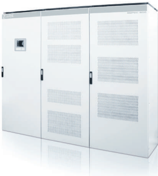
Industrial UPS DVC SEPEC 800 KVA

Its main function is to guarantee the continuity of the power supply in industrial processes where maximum loads availability of mains is a fundamental requirement. Its design allows it to work together with emergency generator units in a configuration that eliminates network interruptions completely, avoiding interruptions, also eliminating generator declassification problems deriving from harmonic generation of double conversion UPS.